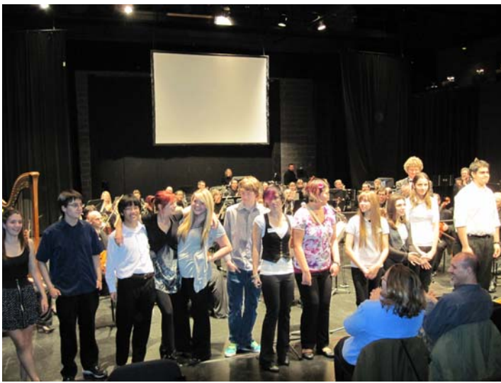
Design A Concert Group 2010