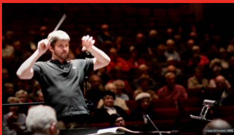
Open Dress Rehearsal January, 2010.

For the year ended July 31, 2010, we raised $1,265,710 from individuals, $417,929 from companies, and $132,487 from private foundations, surpassing our fundraising goal by over $200,000. This is in addition to $1.460 million we received in government grants and $51,000 raised by the KWS Volunteer Committee. We want to thank all of the people, companies, private foundations, and government agencies for their generous support to help us end the 2009/10 season successfully. THANK YOU!